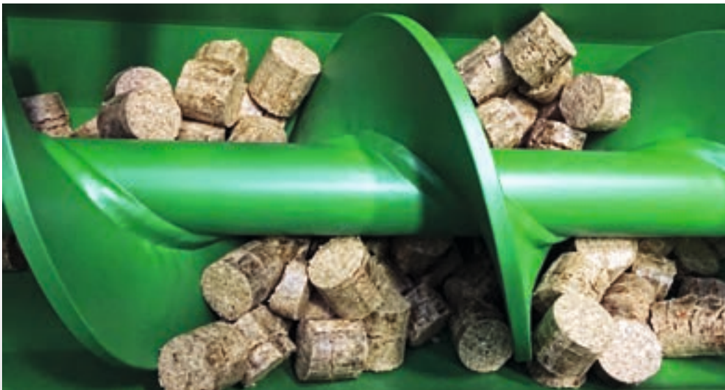
Screw conveyer with Briklet press briquettes

We reserve the right to make technical changes – throughput rate depends on the source material.